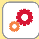
The Start-Up Phase