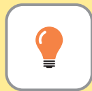
The Idea Phase

You will face different challenges and different needs at each phase of the business development process. North Carolina agencies and organizations provide support throughout the business development cycle. It can be helpful to think of the business lifecycle as proceeding through three main phases: