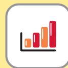
The Growth Phase

This guide describes what we have in North Carolina to help you at each of these stages. Within any of these stages you will come to crossroads where you need to make important decisions, so we are including a fourth section on Resources for Key Decisions.